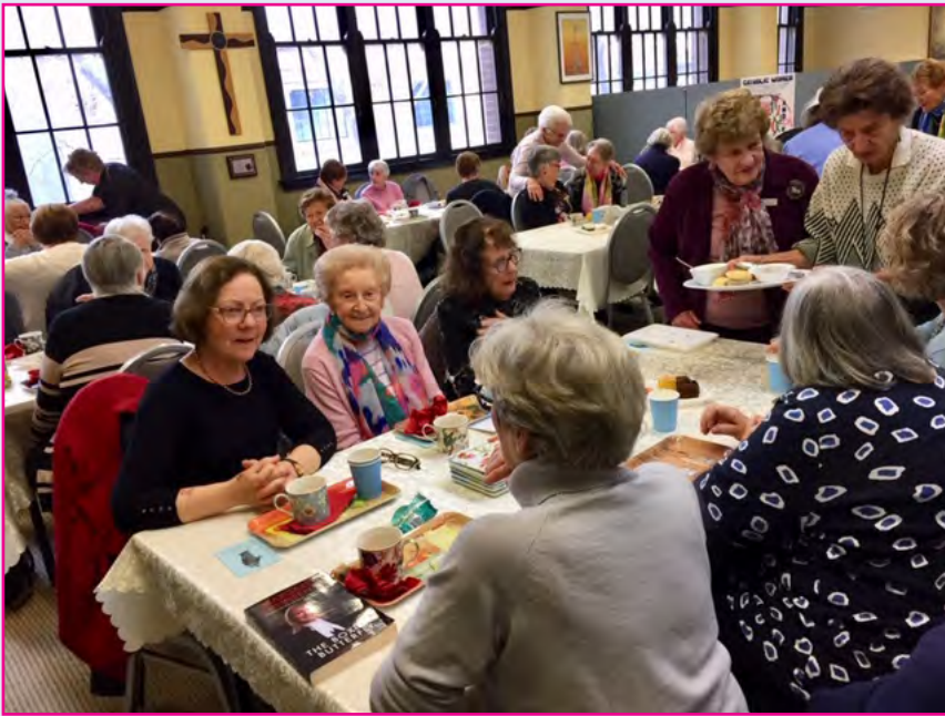
Photos from our Inaugural First Luncheon at St Patrick's Church Hill