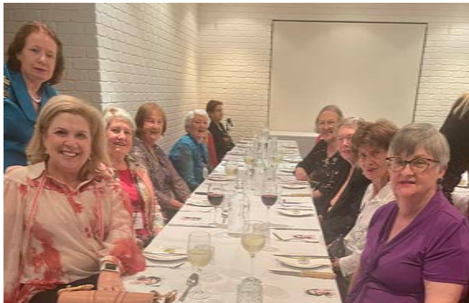
Some of our CWL Sydney members enjoying the festivity at the CWLA State Conference.